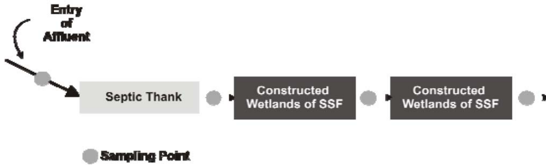
Figure 1: Schematic of the pilot unit