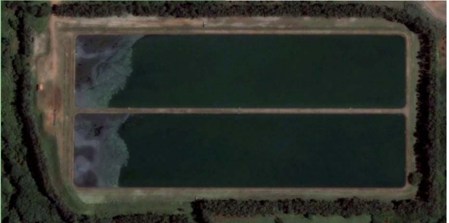
Figure 02 - Ilha Solteira's WWTP space view.